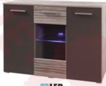
LED BC2 120x85x41cm