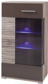
LED BC5 60x108x34cm